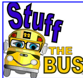
'Gus the Bus'