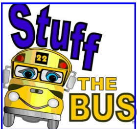
'Gus the Bus'